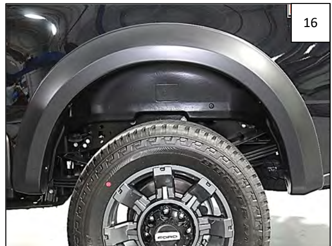
Install 2 supplied Plastic Retainers through flare and into factory holes at rear of wheel well.